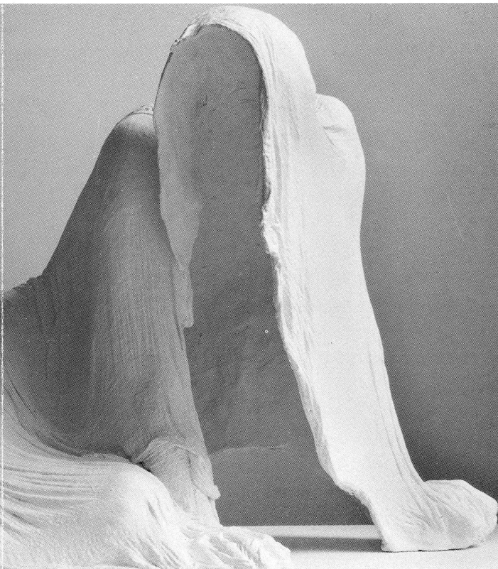
Front Cover "A Tranquil Shadow" 155x45x33cm Back Cover "Solace" 128x62x36cm Above "Memory" 59x66x120cm Right "The Shining Ones" 123x120x20cm